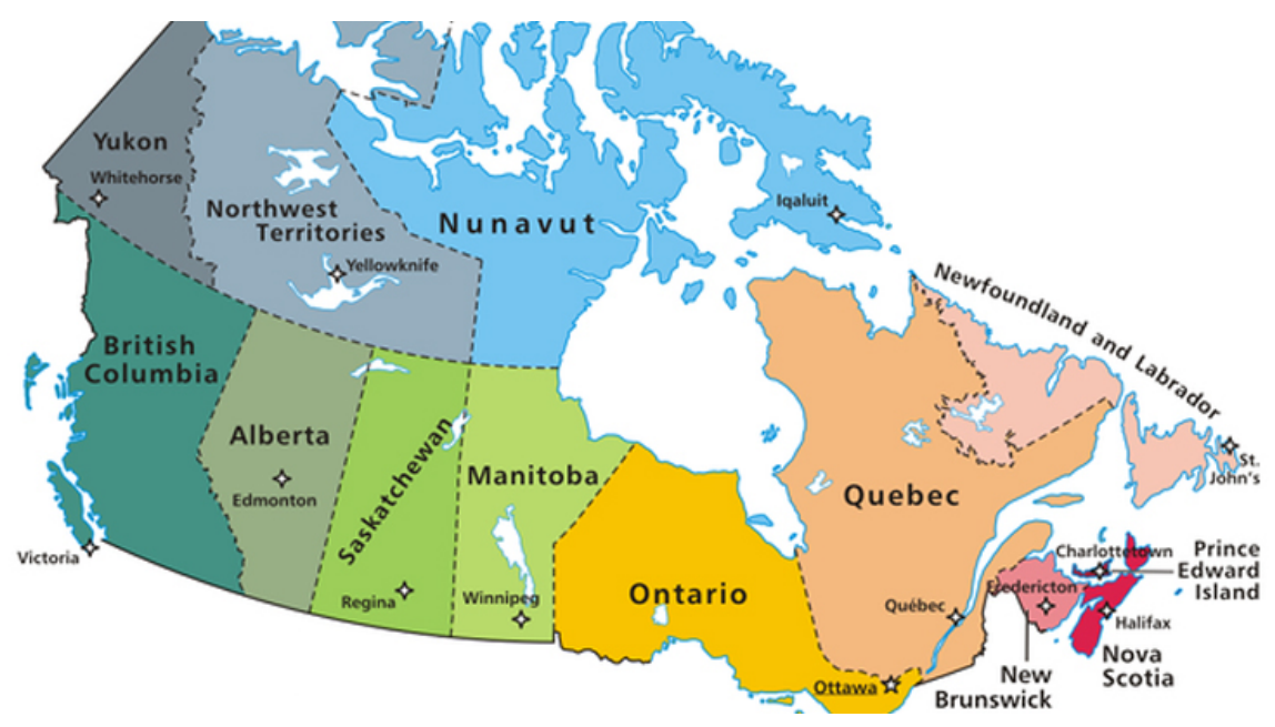
Figure 2: Map of Canadian Provinces and Territories